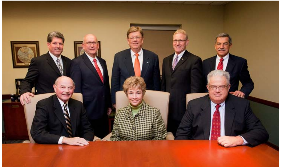
Board of Directors